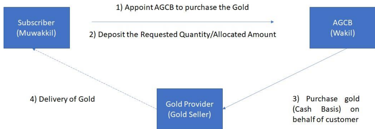
Figure 1: Modus Operandi of Wakalah

Al Ebreiz Global Capital Berhad (AGCB) acts as an Agent to the Subscriber for gold business transactions. The Subscriber ( Muwakkil/Principal ) appoints AGCB ( Wakil/Agent ) to act on behalf of the Subscriber for Sale and Purchase Transactions through Wakalah Contract. On the other hand, Bay' contract will be used between AGCB and the Gold Buyer or the Gold Seller for the Sale and Purchase Transactions whereby AGCB remains as an agent for the Subscriber. In addition to that the Wadi'ah contract will be used for the purpose of safekeeping the gold.